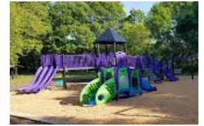
Purple Park/City Hall Park

Now that the snow might finally be over, I would like to take a few minutes to let you know about some of the new and existing opportunities to get out and enjoy our park system. After this long and nearly record-breaking winter that brought us over 7 feet of snow, I'm sure we all are ready for spring and summer to get here. For this summer, here are some of the major projects that will be taking place in our parks.